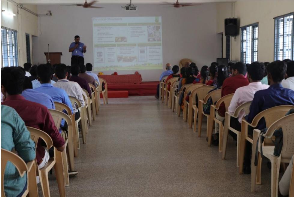
Pre-placement talk by the HR - Way Cool.