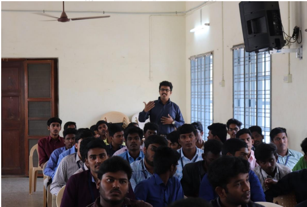
Candidate clarifying doubts with the HR during Interview Process Orientation.