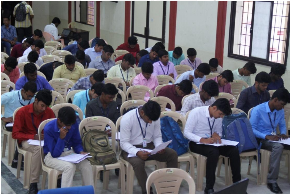
Students attending Aptitude test of Way Cool.