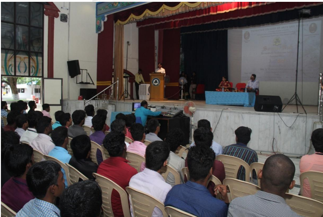
Inaugural session of the Just Dial Placement Drive.